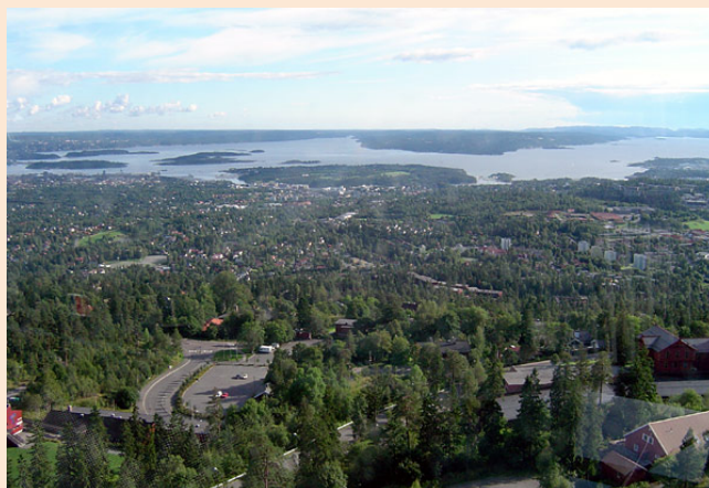
Photo: View on Oslo from the Holmenkollen