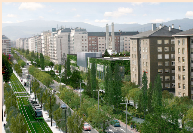
Photo: Green infrastructure planning of the Avenida Gasteiz in Vitoria-Gasteiz, Spain

Nature-based solution: Nature-based community building, based on the potential of urban gardens and parks to connect people, communities, and nature, to avoid growing isolation, disconnection of urban citizens from nature and a resulting loss of ecological knowledge.